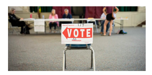
The most important election in Louisiana that many don't...