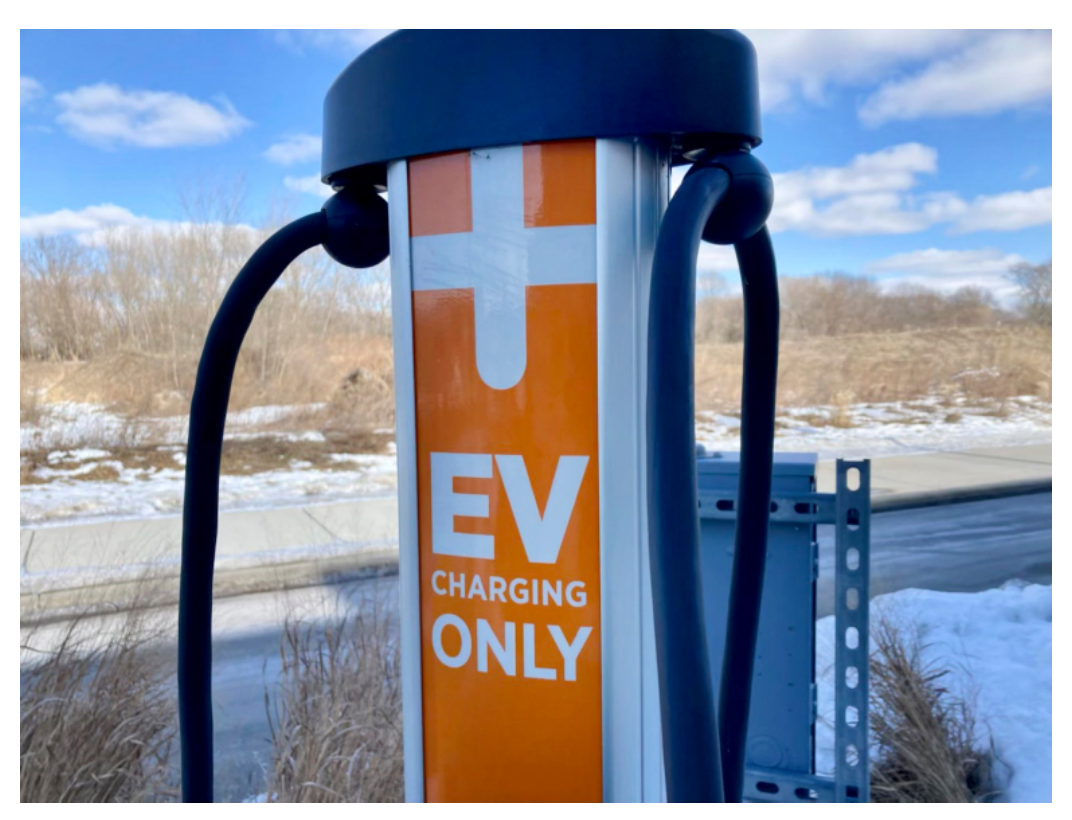
A ChargePoint electric car charging station sits in the parking lot of Garver Feed Mill in Madison, Wis., on Feb. 12, 2022.

certain things. It might not even be good, like gas cars."