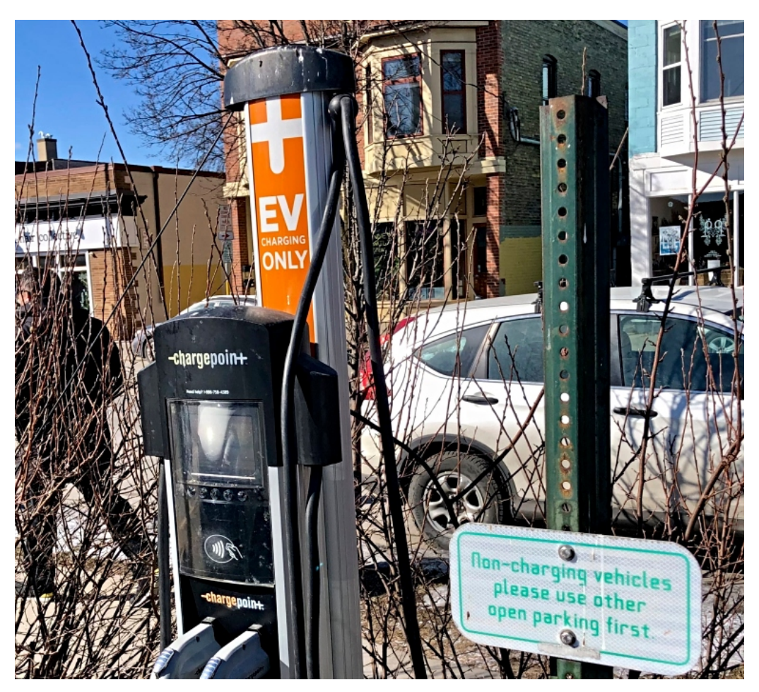
⚠ A ChargePoint electric car charging station sits in the parking lot in Madison, Wis. in Madison, Wis., on Feb. 12, 2022.

But advocates say there is still apprehension among consumers to ditch their gas guzzlers, which they blame in part on disinformation and anti-EV myths pushed by the oil and gas industry.