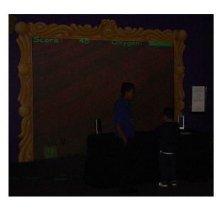
Figure 2: Visitor playing the game at the Discovery Science Center in Santa Ana, California.

During the game, a sufficient supply of oxygen is required in order for the player to survive. The level of oxygen is reduced over time while the player consumes oxygen. The supply of oxygen can be increased by collecting oxygen from the erythrocytes (red blood cells). This can be achieved by simply touching those types of cells. This way, the children can learn about the role of erythrocytes in the human body. In addition, the point score is increased according to how much oxygen is collected. The player wins