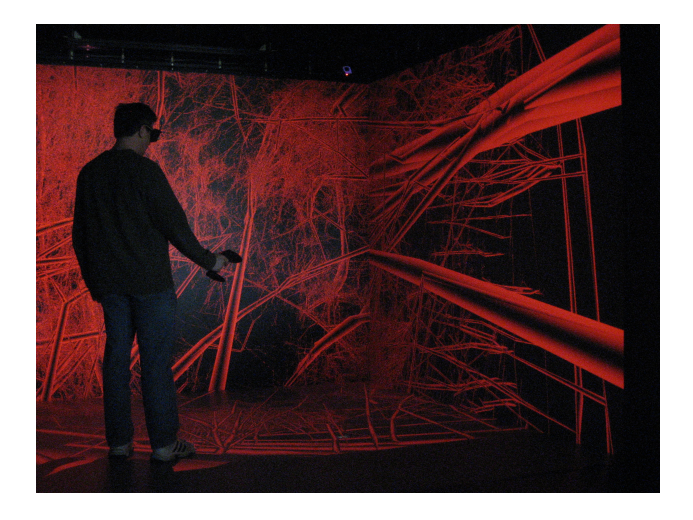
Figure 2. User experiencing the visualization of a large-scale vascular structure in a Barco Ispace.

The four screens located on the floor and the three walls are projected on by Barco Galaxy projectors driven by five computers. There is one computer dedicated to each projection surface plus a master node. Each of these computers is equipped with 4 GB of memory, a dual Xeon 2.5 GHz configuration with an Nvidia Quadro FX 5800. In order to provide a fully immersive experience, an optical tracking system from A.R.T. is used for tracking the 3D coordinates of the user's head as well as the input device, an A.R.T. flystick2.