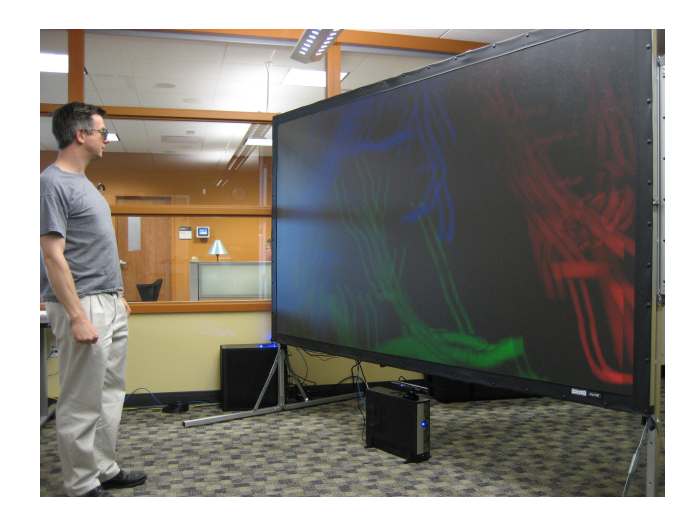
Figure 5. Tracked user in front of the passive projection screen with the tracking computer and the Kinect sensor on top underneath the screen.