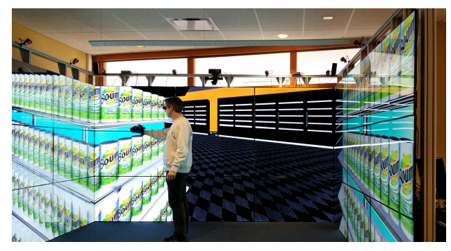
Figure 13. Virtual shopping environment.

Similarly, a virtual shopping environment can be created in which a study participant is asked to indicate when he or she takes notice of specific items within the environment while moving automatically or autonomously through the environment. Figure 13 shows an example of such a simple virtual environment. The resulting data is important for an ongoing, NSF-funded research project that studies product placement and legibility issues. As such, display systems like the Barco Ispace and the DIVE system are more appropriate as in this study peripheral vision is an important factor. These systems can provide a field of view of over 180 degrees, whereas head-mounted displays can only deliver up to 140 degrees. As for studying legibility issues, higher resolution displays are likely more appropriate, which is why we will run our experiments using the DIVE system.