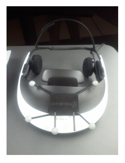
Figure 7. The Sony HMZ-T1 head-mounted display with reflective markers attached for tracking.

that even come with their own tracking systems, such as the Oculus Rift and HTC Vive, for an even lower cost alternative. While the Oculus Rift is supported in Linux, Linux support for the HTC Vive is still not fully available. However, first tests with the HTC Vive in our lab seemed very promising.