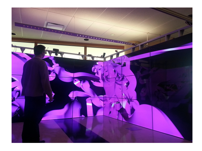
Figure 11. User exploring a molecular rendering based on VRProtoshop.

Our simulation framework builds on Open Source software packages, including SmartBody [31] and OpenSceneGraph (OSG). Figure 12 outlines the architecture with all of its major components. This provides a very flexible tool that can explicitly incorporate geometric models to form a complex, computationally accessible representation of the experienced environment. Our suite of generic models make the process of generating a scenario more efficient. The software framework is designed to ingest a configuration file that describes the entire scenario in such a way that it specifies which models to incorporate into the