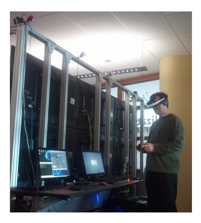
Figure 8. User wearing a head-mounted display. Head position and input device are tracked via the optical tracking system mounted on the aluminum framing (top left).

Obviously, head-mounted displays provide a great advantage in that the user can look in any direction and still be presented with