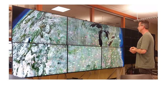
Figure 6. A user in front of the 4K tiled display wall.

full 720p resolution per eye at 60Hz. When using a head-mounted display the tracking system has to provide directional information in addition to the position, i.e. full 6 degree-of-freedom (DoF) data. However, the Kinect sensor is not capably of reliably producing directional information as it derives the direction from the skeleton by considering the previous attachment point within the skeletal structure. This is not precise enough for use with a headmounted display. Instead a more reliably tracking system, such as the NaturalPoint OptiTrack could be used. This requires the use of reflective markers which have to be mounted on the headmounted display. For better tracking results, these markers should extend beyond the user's head to ensure optimal tracking results while the user moves around. This is why the standard marker configuration that comes with the OptiTrack system shown in figure 7 was replaced with a custom-made configuration that sticks out further shown in figure 8, which depicts a user wearing the head-mounted display. The marker spheres mounted to the top front of the display are tracked by the OptiTrack system using the red cameras in the top left corner of the image mounted to the aluminum framing. Similar to the head-mounted display, reflective markers are attached to the input device (figure 9 to provide 3D positional and directional input capabilities for full 6 degree-offreedom input.