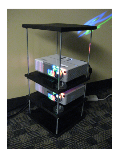
Figure 4. Set of projectors in a passive stereo configuration with polarization filters mounted in front of the lens.

Some visualization tasks may require even more immersion to further embed the user into the data visualized or the simulation. There are different ways to create such an environment. One way is to use head-mounted displays (HMDs). In order to provide a cost-effective solution, consumer-grade head-mounted displays are entering the market that are geared toward watching 3D bluray movies. However, these types of displays still provide full 3D capabilities. For example, the Sony HMZ-T1 supports the 720p topbottom HDMI mode at 60 frames per second therefore providing