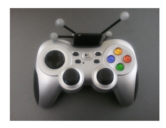
Figure 9. Logitech gamepad with reflective markers attached for tracking.

To provide reliable tracking of head position and input devices, NaturalPoint's OptiTrack optical tracking system was chosen. since optical tracking requires line of sight between the cameras and the marker spheres, it is helpful if the marker spheres extend beyond the head to avoid occlusion. In addition, the number