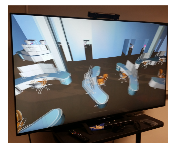
Figure 3. Rendering of a vascular structure using a 3D TV combined with optical tracking.

The described passive stereo rear-projection screen configuration provides a comparably low-cost environment with equipment cost of less than $6,000. In order to keep the cost low, a custom-built projection stand was designed consisting of wooden horizontal levels connected vertically by threaded rods. Figure 4 shows the setup of the projectors. The two center levels, where the projectors are sitting on, are very adjustable as they rest on wing nuts that can slide up and down the threaded rods by simply turning them. This provides very fine-grained control over the projected image as all four corners can be adjusted individually so that the overlap between the left and right image produced by each of the projectors can be dialed in very effectively. The linear polarization filters are mounted at a distance of a few centimeters in front of the lens to prevent overheating and melting of the filters.