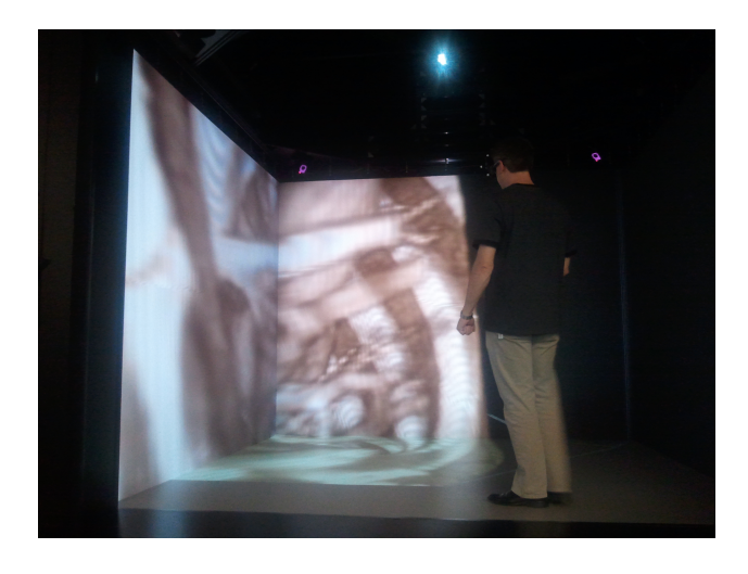
Figure 10. User exploring a volume rendering of a CT angiogram data set in an immersive environment.

So far, several projects in our group were ported to take advantage of the immersive display technology. Vascular renderings can help investigate the geometric configuration of that structure. This can be very useful for vascular structures that were modeled based on statistical assumptions to ensure that the model generated is accurate and that there are no flaws in the algorithms that created the model. An example for rendering such large-scale models is shown in figure 2 where special rendering techniques are used that deploy a geometry shader to compute billboard representations of the individual vessel segments followed by a shader program to make the billboards look like tapered cylinders. Similarly, vascular structures extracted from CT scans can be displayed to search for geometric configurations indicating a diseased state or high risk areas, such as the one shown in figures 5. From the experience so far, such immersive renderings can make it easier for the user to navigate the structure as navigation is more natural in that it tries to mimic the real-word navigational model in which the user moves around and the perspective from the current point of view is recreated by the display.