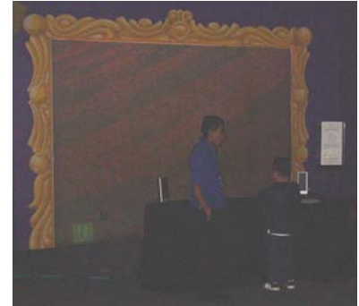
Figure 2: Visitor exploring the exhibit at the Discovery Science Center in Santa Ana, California.

The software is scalable in terms of the physical size of the blood vessel systems and the amount of geometry data that is used to represent it. It can be ported to various virtual environments (VEs). At this point, it has been tested on a regular desktop computer and a large projection screen, which was