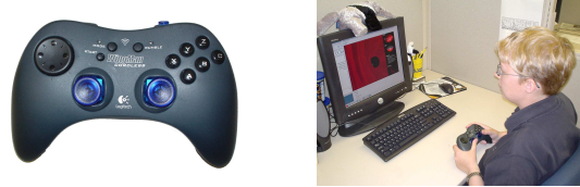
Figure 2: The Logitech® WingMan® Cordless Rumblepad™ in a desktop environment.

Since we want to effectively explore the 3D model, a 2D input device, such as a desktop mouse, obviously has its limitations. An additional cordless USB input device supplements our system and provides unrestricted navigational control in 3D. As a result, the system provides a flexible low-cost 3D virtual environment, which enables efficient and intuitive 3D navigation. In the current implementation, the Logitech® WingMan® Cordless Rumblepad™ was chosen as the main 3D interaction device, because it provides several digital and analog joysticks that emulate six-degrees-of-freedom input. The software is scalable to various virtual environments (VEs). Such a VE facilitates the simulation of computer-aided diagnoses similar to those obtained in real-world surgery environments.