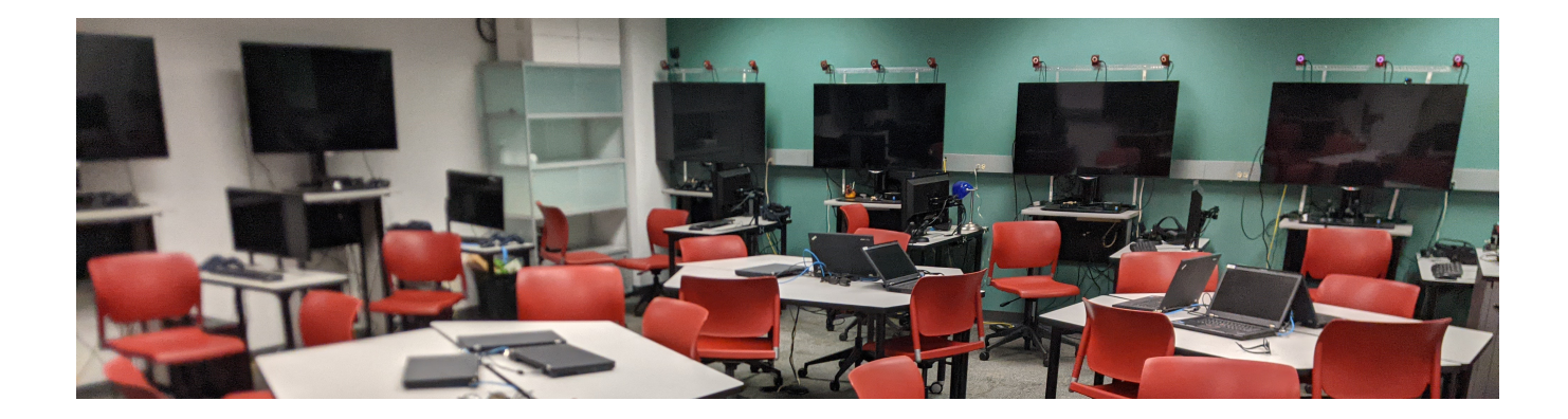
Figure 3. Teaching lab with access to AR/VR technology including head-mounted displays and graphics workstations.

overlay images of fully animated organs and other internal structures are displayed on the traditional manekins (Menon et al., 2022; Menon, Wischgoll, Farra, & Holland, 2021). Figure 2 shows an example of the training application for nursing students supplementing the traditional training environment by displaying the rib cage and fully animated organs, such as the heart and lungs, through the AR device. Another application was for assisting surgeons to visualize fractured ribs through the skin based on a CT scan during corrective surgery (Menon, Wischgoll, Farra, & Holland, 2020; Sensing, Parikh, Hardman, Wischgoll, & Menon, 2021). This allowed the surgeons to reduce the size of the incision to lessen the impact to the patient.