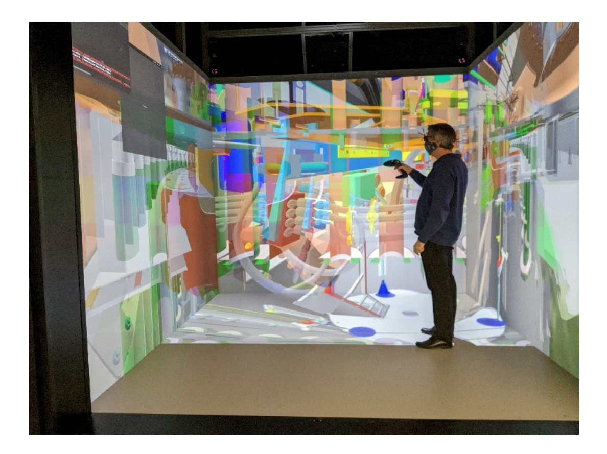
Figure 6. A user interactively exploring the design of a wind turbine in the Virtalis ActiveCube. The system enables to user look inside hidden objects or move elements blocking the view interactively.

system provides the maximal field-of-view humans are capable of perceiving. This enabled us to use the DIVE system successfully for various human perceptional studies, such as the one performed by Guthrie et al. (2018). In this study, a participant automatically moved through a virtual environment with shelves on either side. The task was to find objects that differed from the majority of objects. Based on the head tracking data, the effort needed to find these objects in different configurations and at varying speeds was identified. This study revealed that some geometric shelf layouts were clearly superior to others.