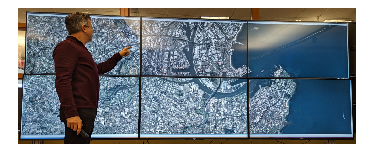
5 Figure 4. High-resolution tiled display system satellite imagery. The high resolution of the display can reproduce the fine details of the imagery when 6 exploring or discussing this type of data.

environments, tiled configurations are a common way of supporting those applications. One of our configurations uses a 2-by-3 setup comprising Sony's 50-inch 4K TVs (Wischgoll, 2017) depicted in figure 4. The entire system is driven by a single computer with two graphics cards to allow easy deployment of standard software packages. To provide intuitive input modalities, this system uses a Logitech touchpad T650 to enable smartphone-style interaction metaphors and a wireless gyro-based mouse and keyboard combination built into one device.