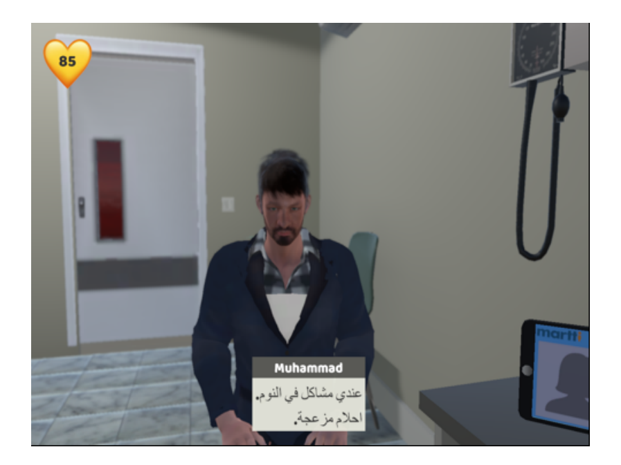
12 Figure 8. Simulated training environment for medical personnel used to better prepare physicians and improve different metrics, such as empathy.

More recently, we received funding from the Ohio Department of Medicaid for developing simulation environments for virtual training of medicaid professionals. These training environments are intended to reduce bias among the trainees toward patients with addictions (Hershberger et al., 2022) or autism spectrum disorder (Patel et al., 2023) among others. Figure 8 shows an example of such a training environment. It depicts a refugee consulting a physician. The training environment includes the entire interaction with the physician where the physician has different options as to how to respond to the patient. The patient then reacts in different ways based on the physician's choices. The simulation also provides the patient's background to allow the participant in the simulation to better understand the patient. Survey questionnaires are built into the simulation to evaluate before and after the physician's interaction with the patient to track the change. With 230 participants in this study, improvements in all metrics were observed, albeit not all of them were statistically significant. Most notably, there was an increase in compassion and reduction in anxiety observed. This series of studies prepared several simulations with different types of patients to cover a wide range.