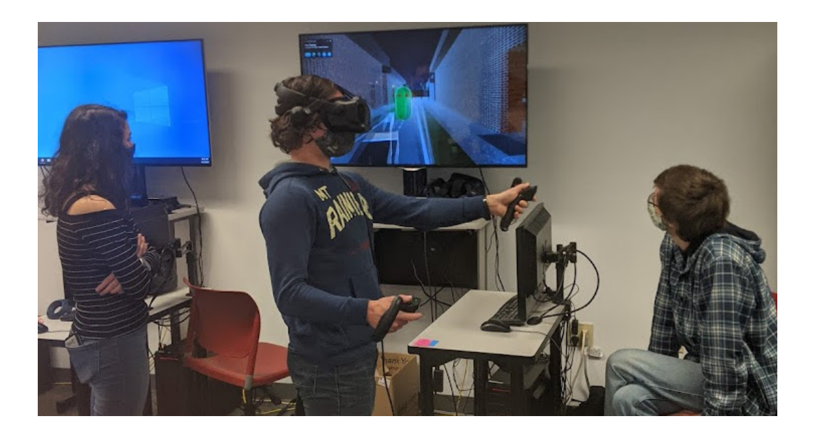
Figure 1. Students using an HTC Vive Eye head-mounted display with their custom-developed software also showing on the screen in the back.

environments in the following sections. It provides insight into managing and administering a virtual reality laboratory by minimizing the effort required to keep all the systems operational.