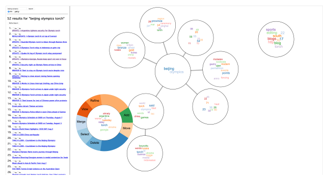
Figure 2. Visualization Screen Image

The search visualization allows users to get a general overview of the topics their search terms may cover and then narrow down the scope of the search until discovering desired results. After the user enters the initial query, the application generates a central "bubble" that contains the search terms. This bubble acts at the root for a tree in which each child represents a subset of