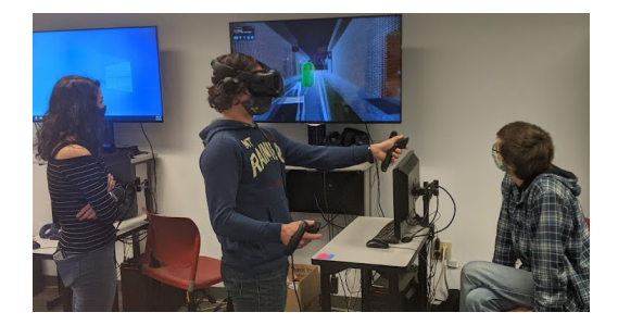
Figure 2: Students using an HTC Vive Eye head-mounted display with their custom-developed software also showing on the screen in the back.

This paper outlines the various display systems and environments available at Wright State University and discusses both the hardware and the software aspects to administer and support these environments in the following sections.