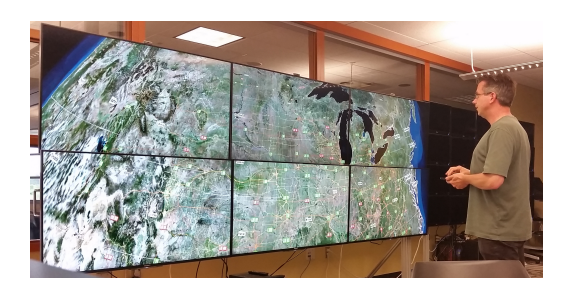
Figure 3: High-resolution tiled display system showing a GIS application based on OpenStreetMap.