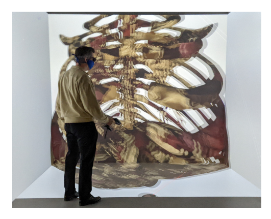
Figure 1: Anatomic visualization in a CAVE-type display system.

Thomas Wischgoll* Wright State University